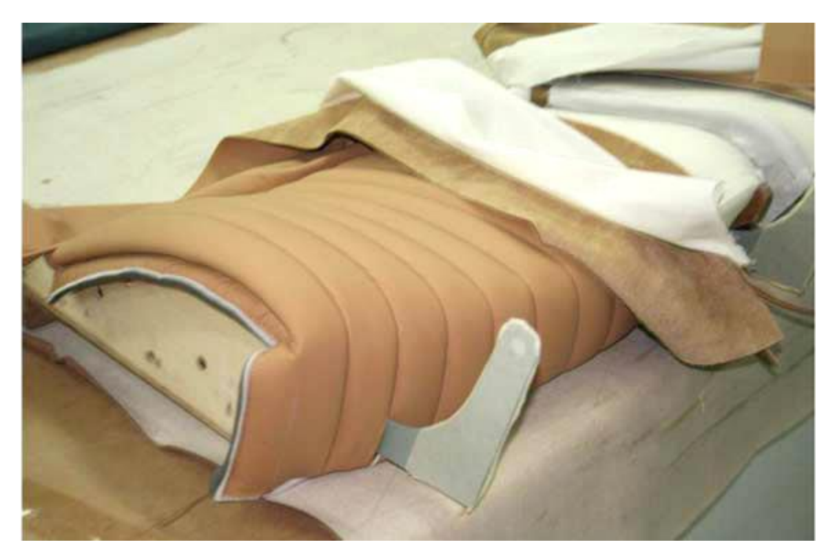
Starting from the bottom, the covers are pulled up over the seat backs.