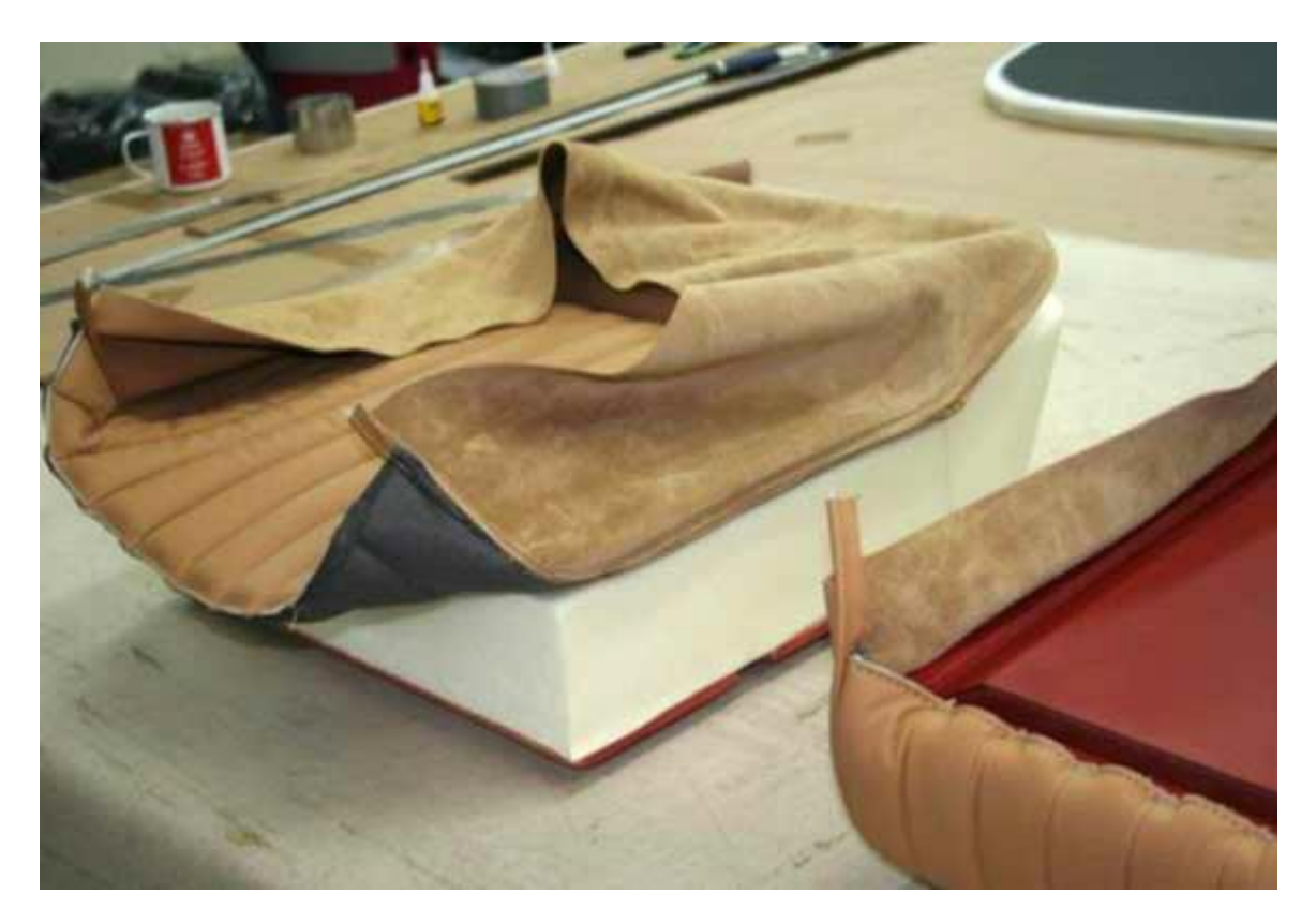
The foam on the base with the cover about to be pulled over them

Once the squabs have been stripped off, the bases should be repainted. The new foam cushion is laid on top and the seat cover very carefully placed on top and pulled down. The covers come ready stitched together and are a good fit.