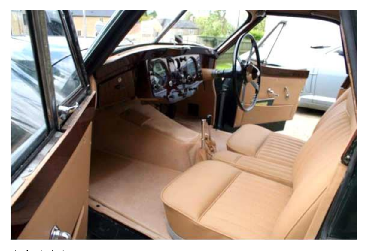
The finished job

We supply trim and carpet kits for all XKs and in all colours and we can also fit them if required. For those of you who fancy doing it yourself, or are just curious as to what is involved, the following describes the work we did recently on a 1953 XK120 DHC.