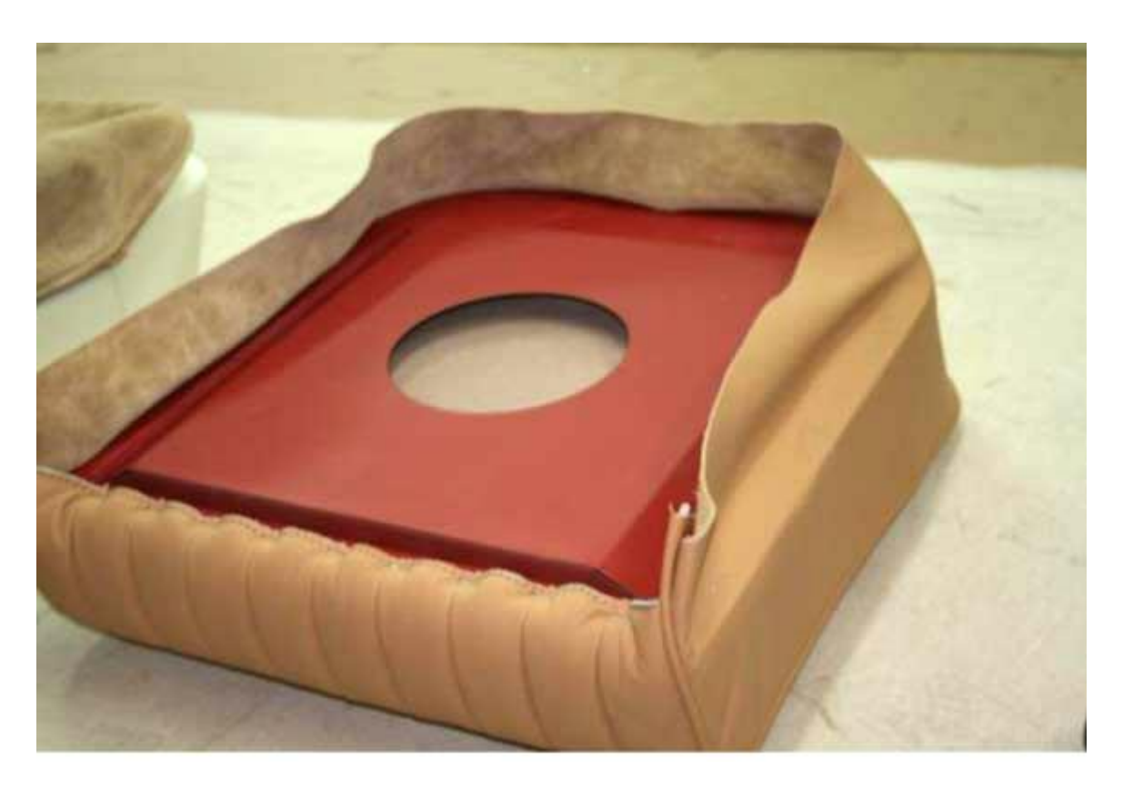
The back edge is first partially tacked to make sure all is square and tight.