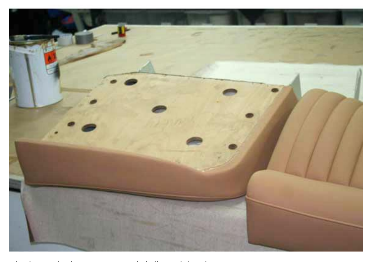
Like the squabs the covers are stapled all round the edges.