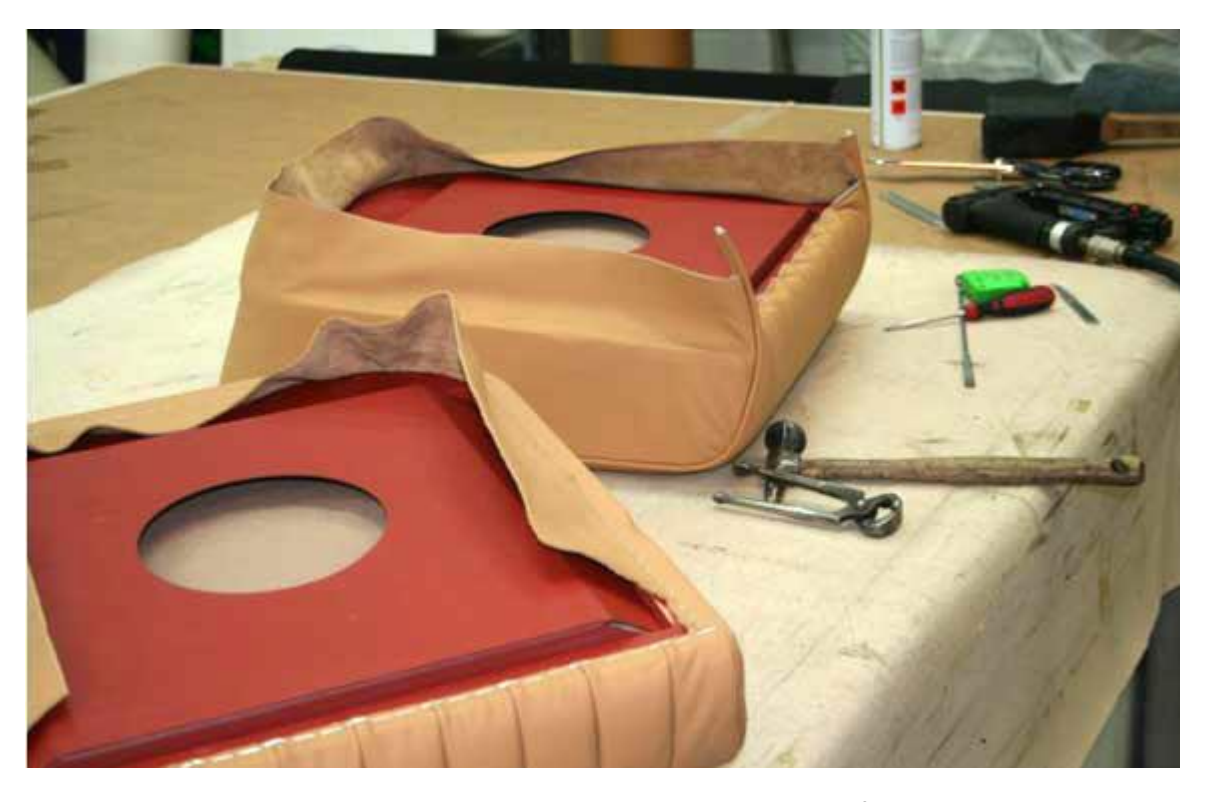
A staple gun is used to staple the leather cover to the wooden edges of the seat bases.