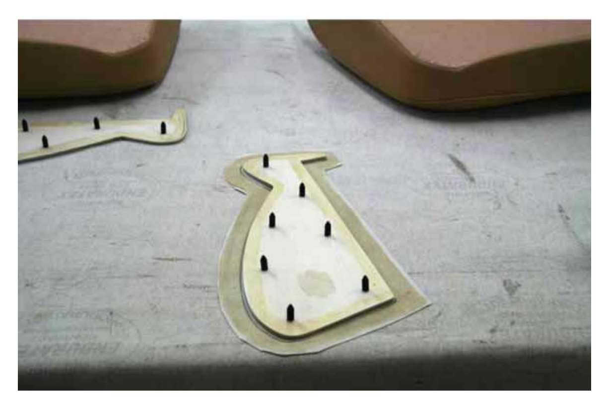
The side panel with the plastic fixings ready for the trim to be glued in place.