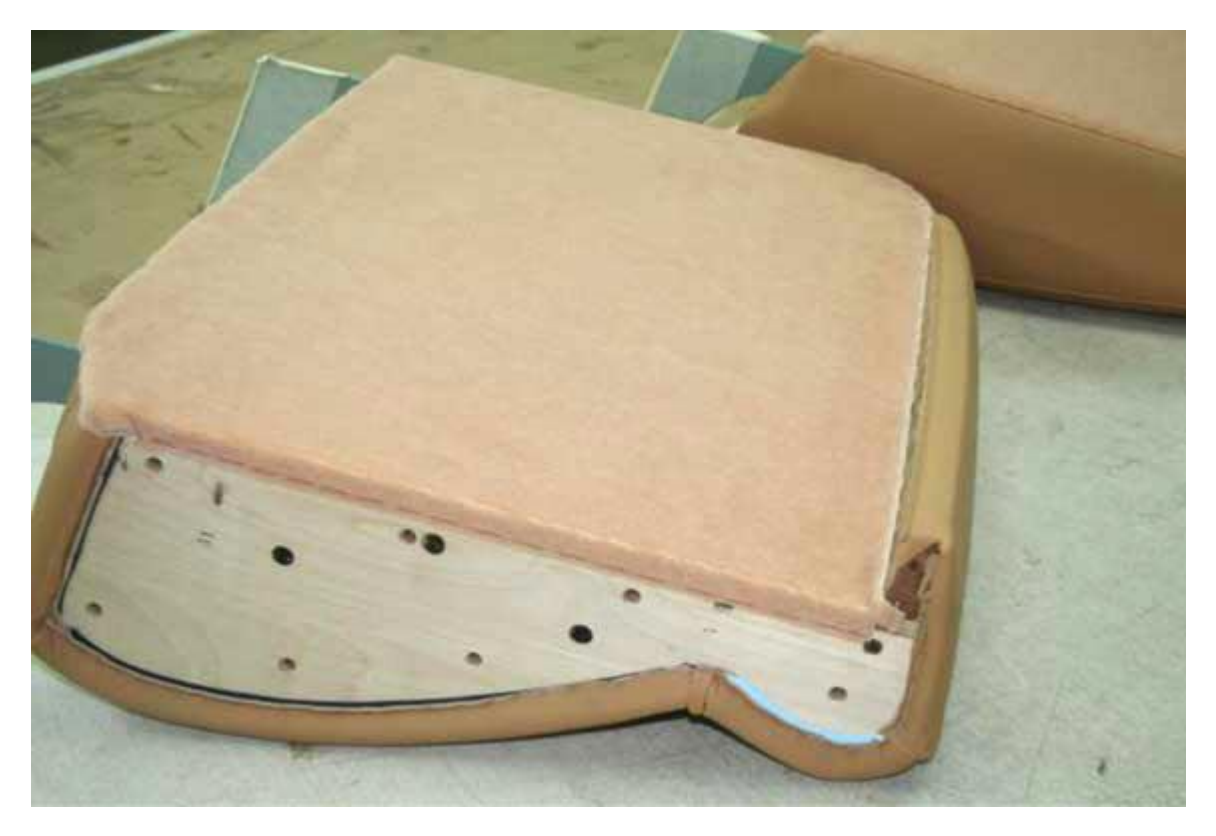
The back is covered and the holes for the side piece fixings can be seen in the side panel.

Go round the edges making sure the tension is even, there are no creases and that everything aligns properly. Once the cover is fully tacked to the woodwork, the cloth back panel is fitted followed by the small trim piece that goes under the top edge. This covers the edges of both the back cloth panel and the leather of the seat cover.