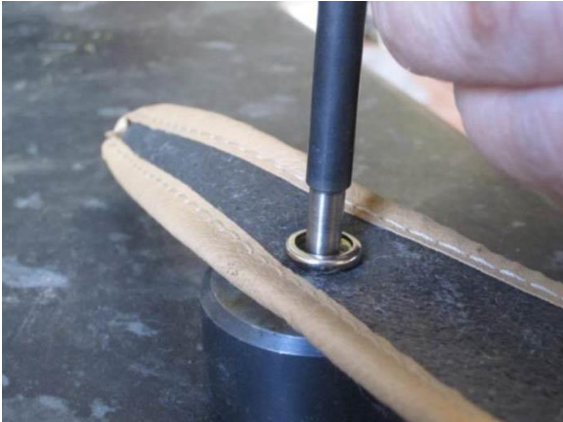
Riveting the button of the Durable Dot fastener with the punch and set.

A bag of Durable Dot fasteners comes with the carpet set. Each fastener comprises three parts - a button and socket, which fit in the carpet, and a stud to hold the carpet in place. The button goes through the carpet, the socket is slid over the protruding part and is then riveted over. This is done with a special punch, while the button sits in a protective and supporting set. In most cases the base studs will be fitted in the same place as the originals were and are either held with a screw or pop rivet. In the case of this car, most of the old studs were simply replaced by new ones in exactly the same locations. The new carpet is then laid out very carefully and accurately, and held in place with tape. A sharp tool such as a bradawl or a spike is then pushed through the carpet in the exact centre of the stud. The Durable Dot button is then fitted. Do each one at a time, and once one is fitted clip it down before doing the next. It is very important to keep the carpet aligned each time you do this and try to get some tension into the carpet so that it sits flat and taut.