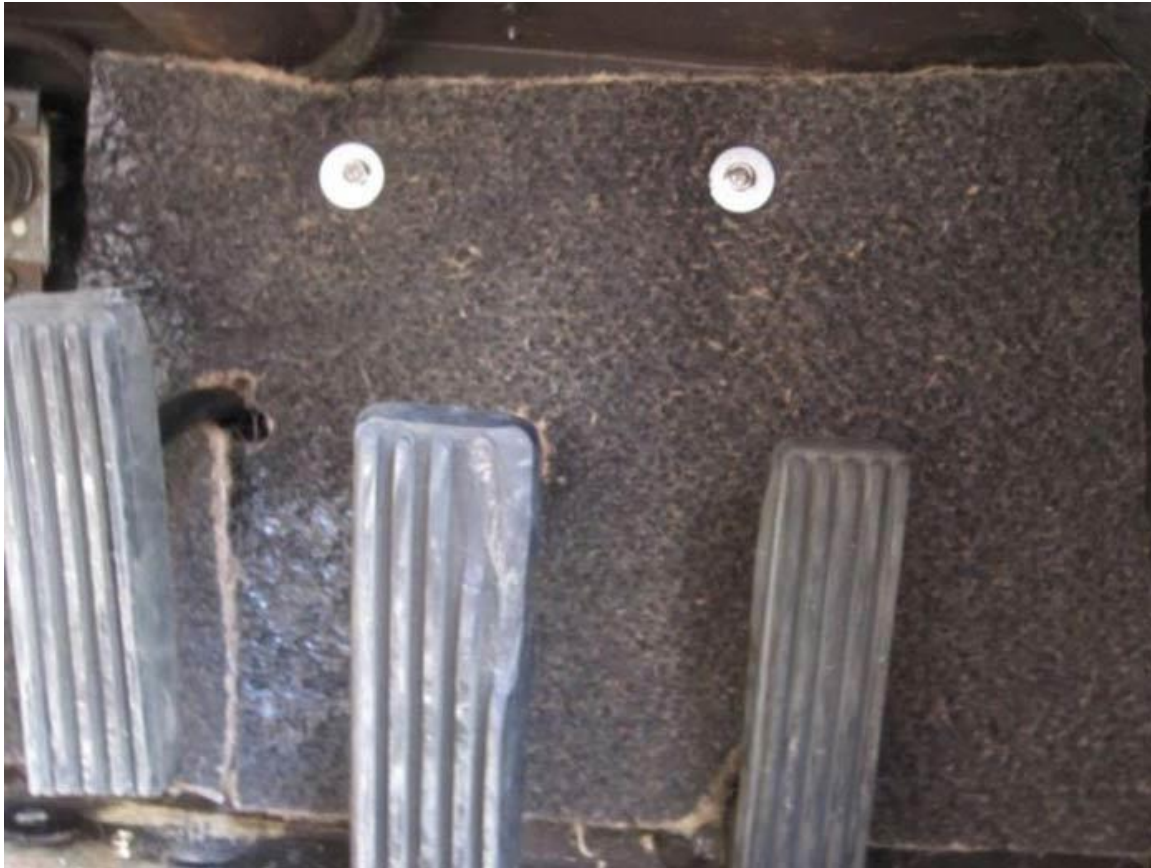
The underfelt fitted to the bulkhead by the pedals showing the studs and 'penny' washers.

The next job is most uncomfortable. That is to fix the insulation and carpet to the front bulkhead. I suggest you start in the passenger well as there is more space and you will gain a little experience before tackling the awkward bit behind the pedals. Unscrew or drill out the old Durable Dot studs and fit the insulation to the bulkhead trimming any excess as necessary. Be careful when drilling or screwing through the bulkhead as there are cables and pipes the other side. Then either pop rivet or screw the studs in place with 'penny' washers underneath them to flatten the underfelt. If you don't use large washers here you will find that the carpet will not stay clipped to the studs.