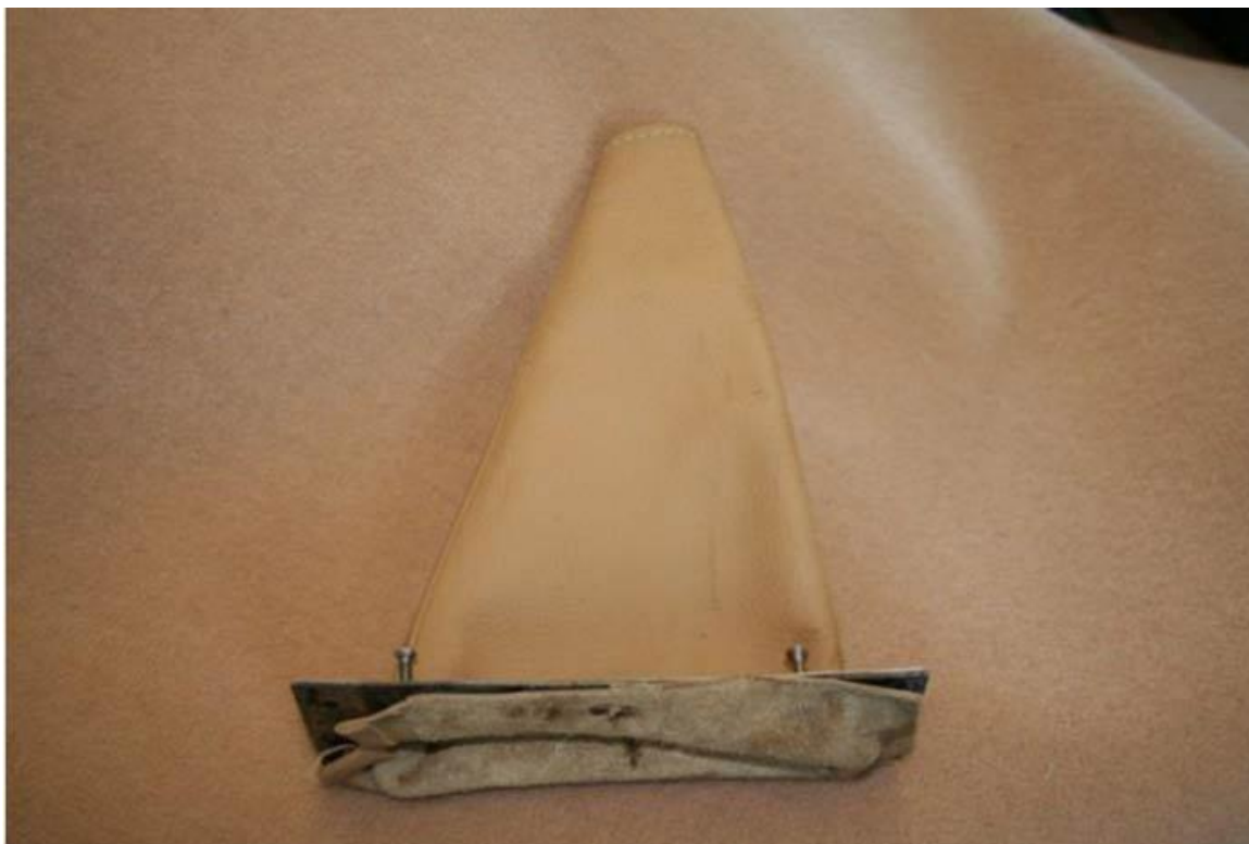
The handbrake boot fitted to the metal bracket.

If you are retrimming the whole of the interior then the carpets are left until last so that all the leathercloth trim coverings are in place and the edges stuck down as necessary, particularly on the A and B post panels. The first job is to lay the under-felt in place. This acts helps deaden noise and gives the carpet that luxurious deep pile feel.