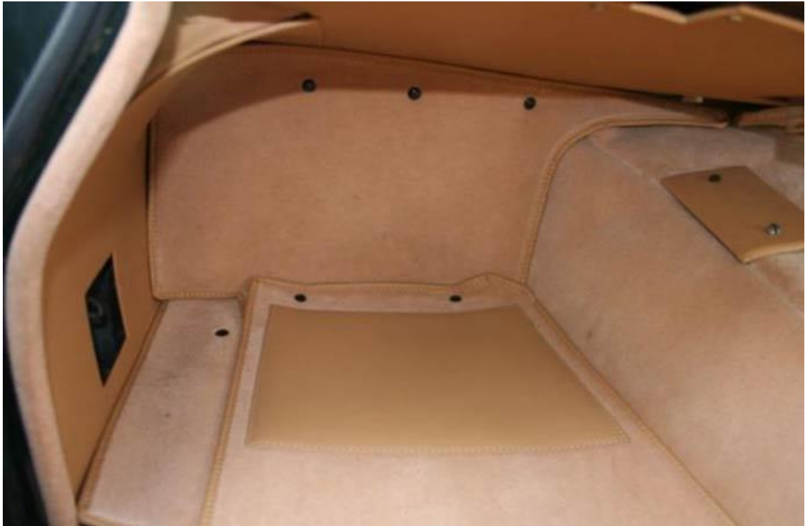
Voilà! The passenger foot well.

Now you can fit the gearbox carpeting properly. You will eventually have to carefully cut out the hole for the gearbox dipstick access and cover but leave this until the very last job as there will be a lot of fiddling needed before you are done. Also don't fit the transmission tunnel cover until just before you refit the seats because part of the gearbox cover carpet sits under the tunnel cover.