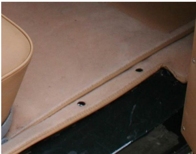
The side strips should be positioned so that the leather binding just abuts the doors.

Now you can fit the gearbox carpeting properly. You will eventually have to carefully cut out the hole for the gearbox dipstick access and cover but leave this until the very last job as there will be a lot of fiddling needed before you are done. Also don't fit the transmission tunnel cover until just before you refit the seats because part of the gearbox cover carpet sits under the tunnel cover.