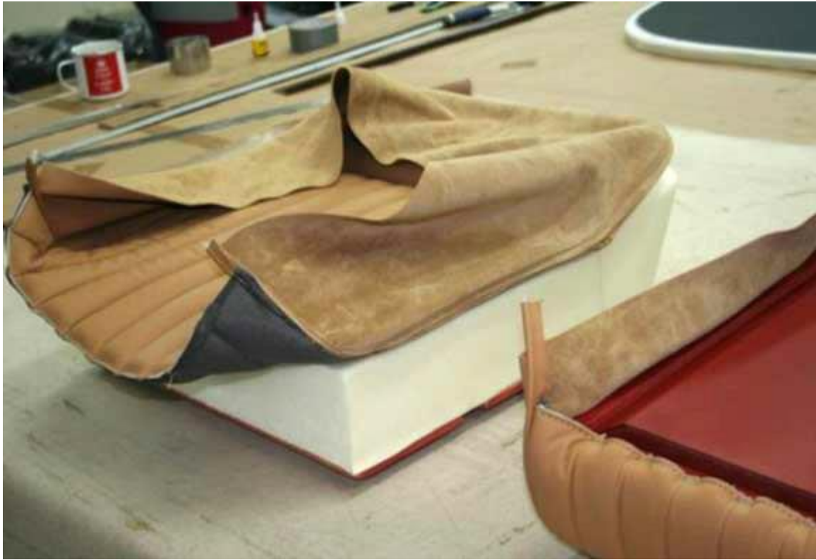
The foam on the base with the cover about to be pulled over them

Once the squabs have been stripped off, the bases should be repainted. The new foam cushion is laid on top and the seat cover very carefully placed on top and pulled down. The covers come ready stitched together and are a good fit.