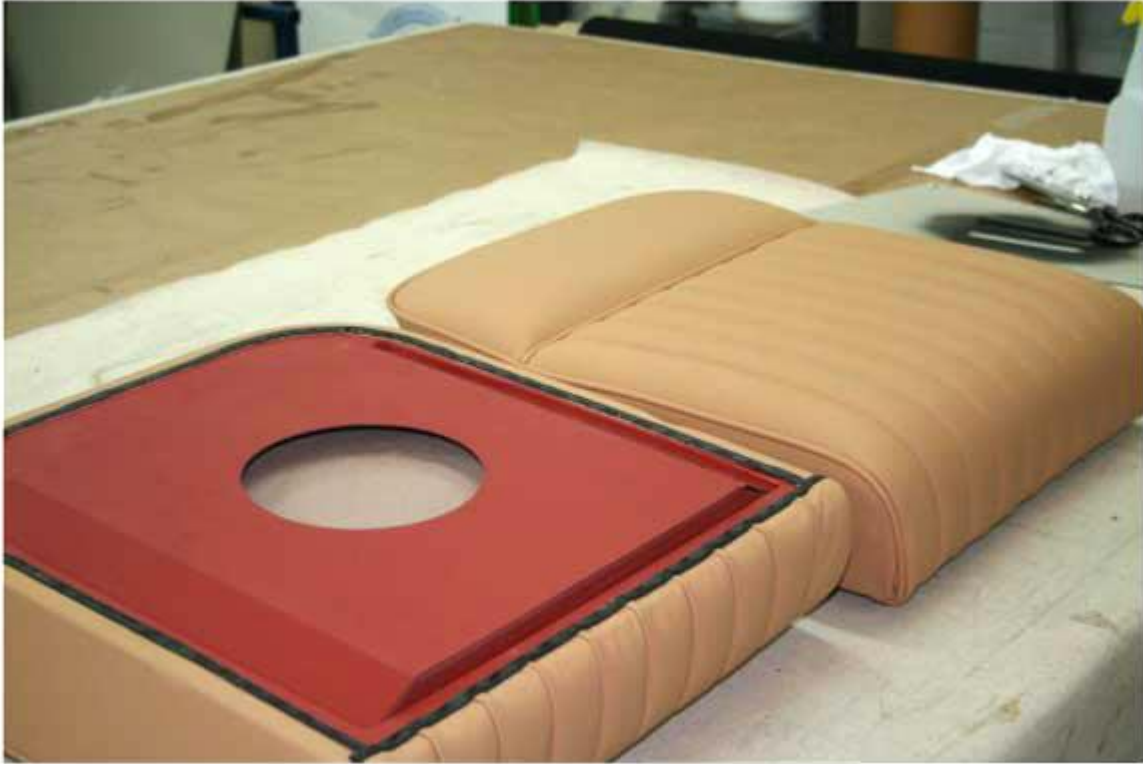
Beading is tacked over the edges of the cover.

Once the tacking has been done, the cover can be fixed permanently. While tacks were used originally a staple gun is the tool of preference these days. The stapling is done all round the edges while constantly checking that the cover is square and taut - creases and slack must be avoided. The excess leather is trimmed off. Once the cover is fixed then beading is tacked around the edge to protect the covers.