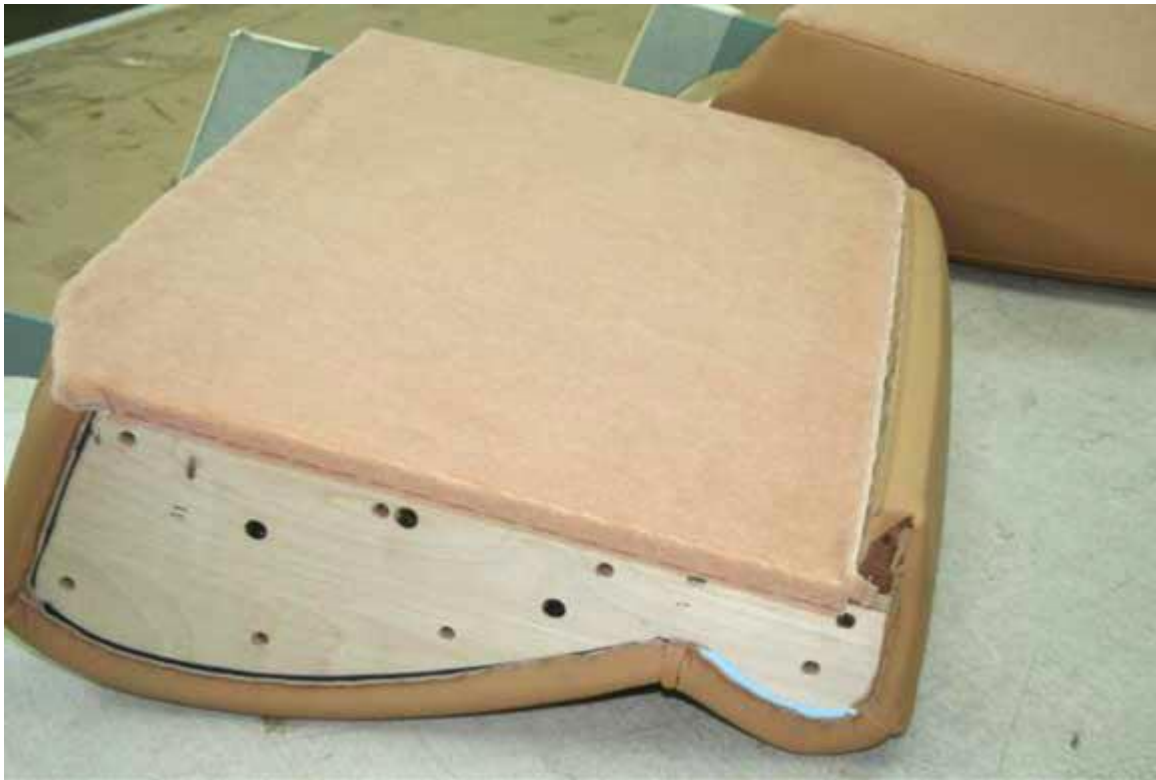
The back is covered and the holes for the side piece fixings can be seen in the side panel.

Go round the edges making sure the tension is even, there are no creases and that everything aligns properly. Once the cover is fully tacked to the woodwork, the cloth back panel is fitted followed by the small trim piece that goes under the top edge. This covers the edges of both the back cloth panel and the leather of the seat cover.