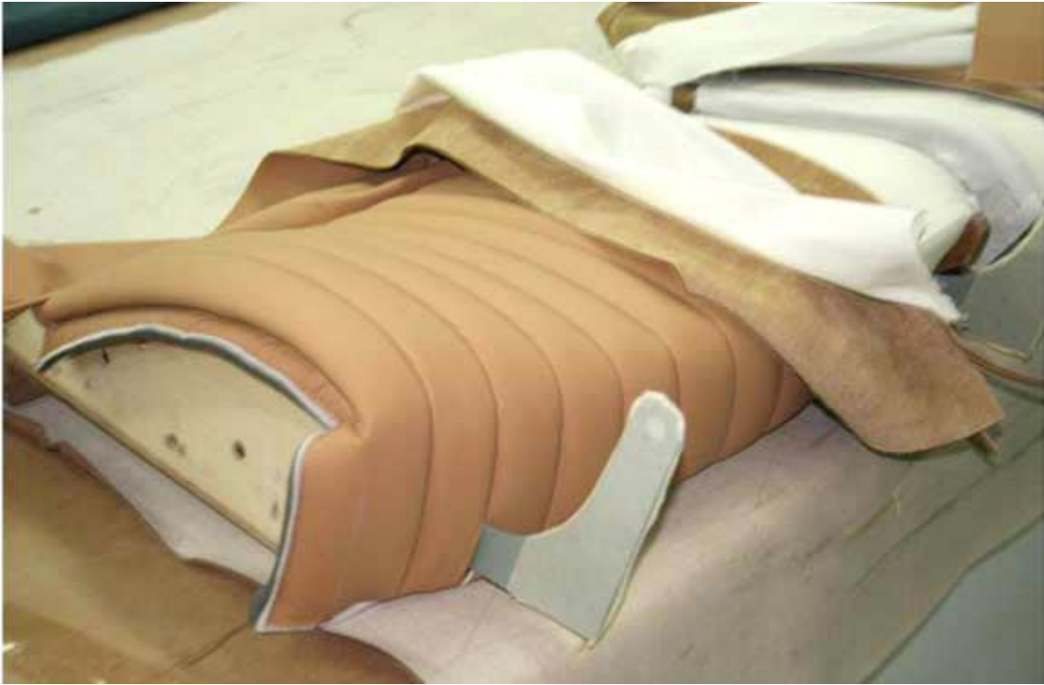
Starting from the bottom, the covers are pulled up over the seat backs.