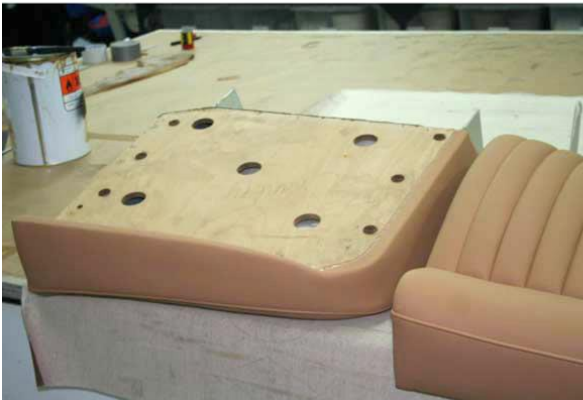
Like the squabs the covers are stapled all round the edges.