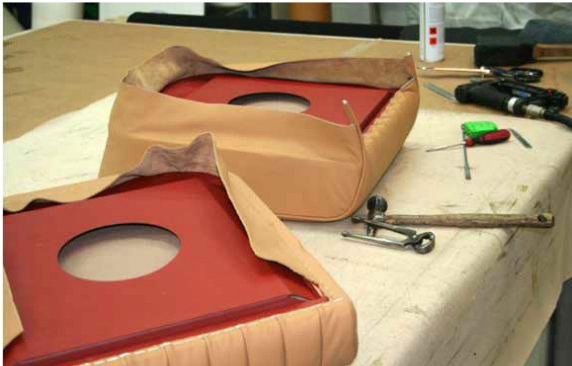
A staple gun is used to staple the leather cover to the wooden edges of the seat bases.