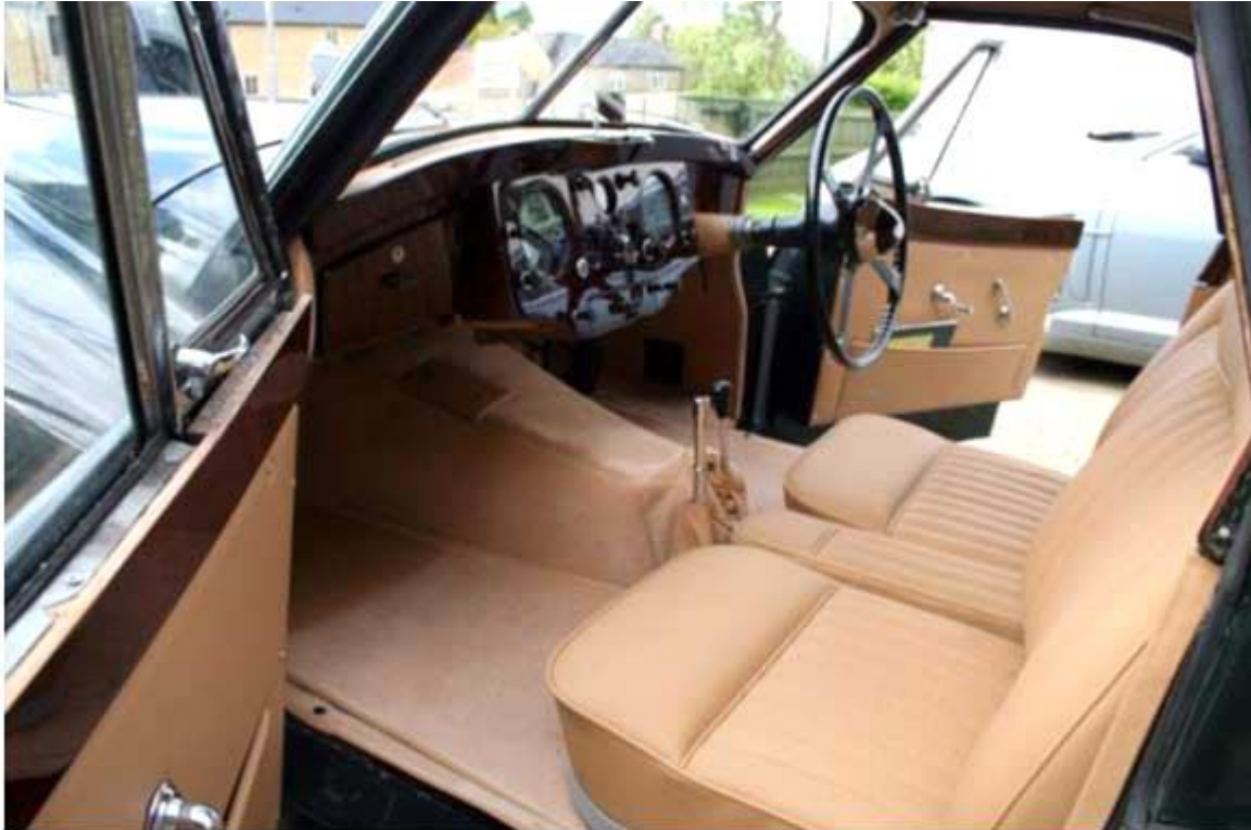
The finished job

We supply trim and carpet kits for all XKs and in all colours and we can also fit them if required. For those of you who fancy doing it yourself, or are just curious as to what is involved, the following describes the work we did recently on a 1953 XK120 DHC.